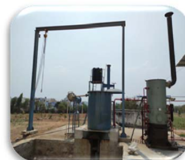
Multi-Purpose FDU with Steam Boiler