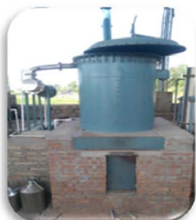
Field Distillation Unit (FDU)