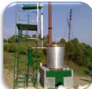
FDU with Cohobation Column